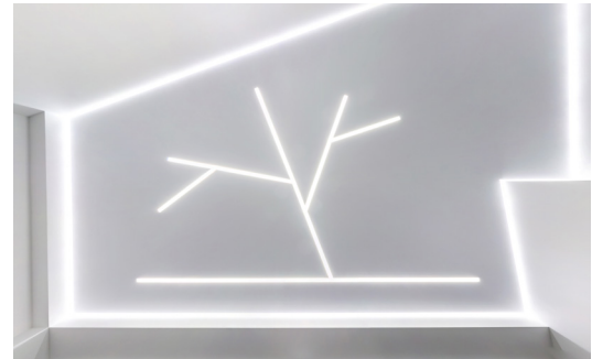
Measured performance in edge-lit LED panel

BrightWhite™ reflectors are available as a film, tape, or laminated to metal. They are easily and cleanly cut using laser, die, shear, or blade cutters. Shapes can be created with standard thermoforming techniques to line the interior surfaces of luminaires. Metal versions are compatible with shear, punch, roll, and other standard sheet metal processes.